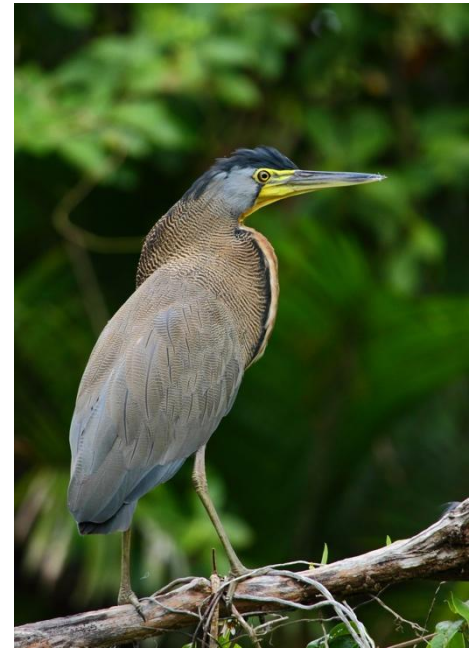
Bare-throated Tiger Heron

At Caracol, we will focus on sketching the expansive archaeological ruins in the context of the surrounding jungle. We will take our time to sketch the interplay of the ancient architectural stonework and