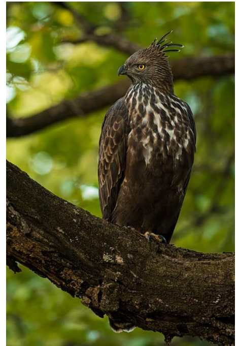
Crested Hawk Eagle

All the parks in this tour have huge diversity of birds, with as many as 350 species seen during different seasons, many of which are winter migrants. Resident species include Brown Fish Owl, Indian Scops Owl and the rare Oriental Scops Owl. Spotted and Jungle Owlet are common. Lesser Adjutant and Woolly Necked and Black Stork are common sightings as are White Throated, Pied and Stork Billed Kingfishers, Indian Grey Hornbill and sometimes a Malabar Pied Hornbill. Lesser Goldenback, White-naped, Yellow Crowned, Rufous, Streak-throated, and Brown-capped Pygmy Woodpeckers can be heard and seen throughout the day, while the Coppersmith and Brown-headed Barbet are difficult to spot but possible in fruiting trees. Meanwhile, Tickell's Blue Flycatcher, Grey-headed Canary Flycatcher, Scarlett Minivets, Green Bee-eaters, Red Avadavats, Rose ringed, Alexandrine and Plum-headed Parakeet and Indian Rollers add a splash of color